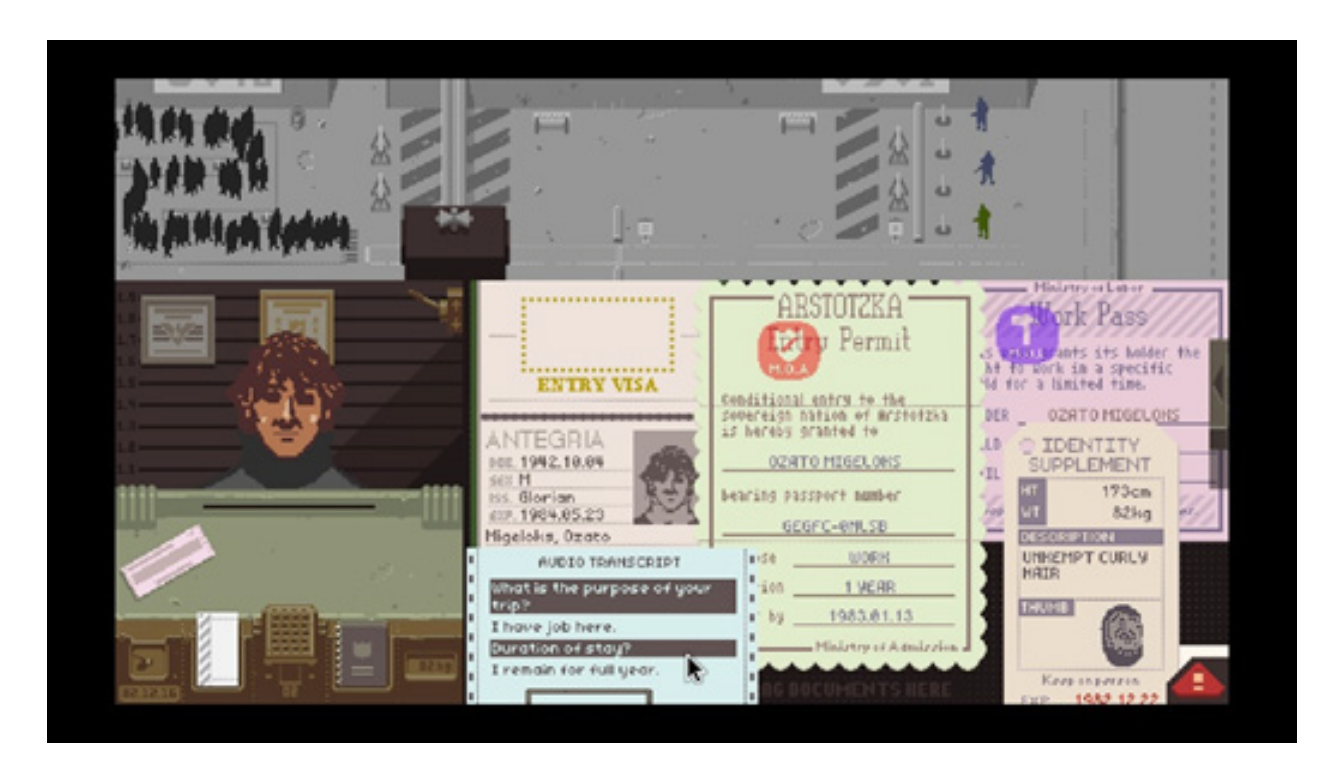
Figure 3: Some of the Documentation Required in Papers, Please (Pope, 2013)

Players were rewarded with an in-game salary, which at the end of each day was used to provide food, medicine and warmth to your family. Salary was awarded on the basis of every correctly processed applicant. Failures included allowing those with invalid documentation to pass and rejecting those who meet all the immigration criteria. Failures result in written citations, and if enough of these accumulate, financial penalties. Every day, meeting all the needs of your family costed a certain amount of money, and anything else was added to your bank balance to cover future problems. The eventual ending you get depends on how well you succeed in making it through the game without being arrested, fired, and with your family intact and healthy. Only one ending was considered "completing" the game, and this in turn opened up the "sandbox" mode for play.