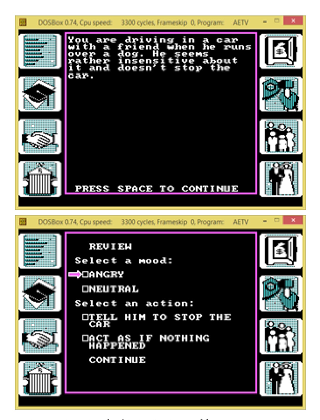
Figure 2: Vignette Mood and Action (Activision, 1986)